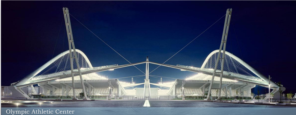
Olympic Athletic Center