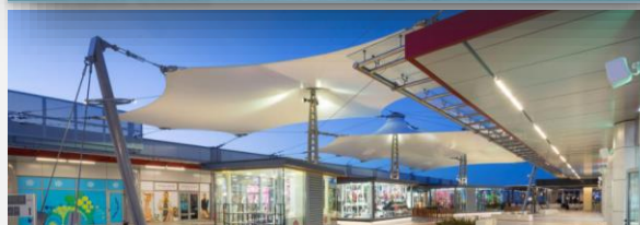
Mare West Mall Center