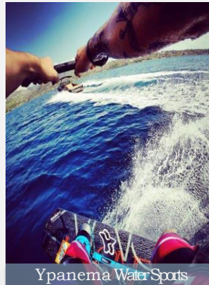
Ypanema Water Sports