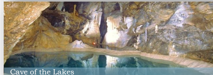
Cave of the Lakes