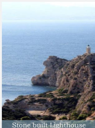
Stone built Lighthouse