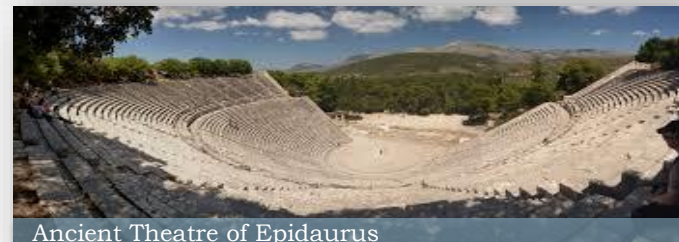
Ancient Theatre of Epidaurus