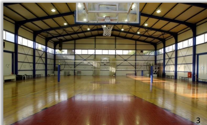
SPORTCAMP Indoor Hall